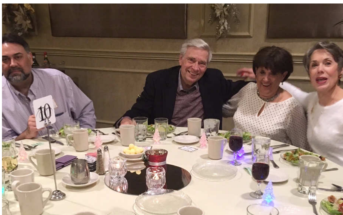
Christmas Party photos, lots of fun for all!