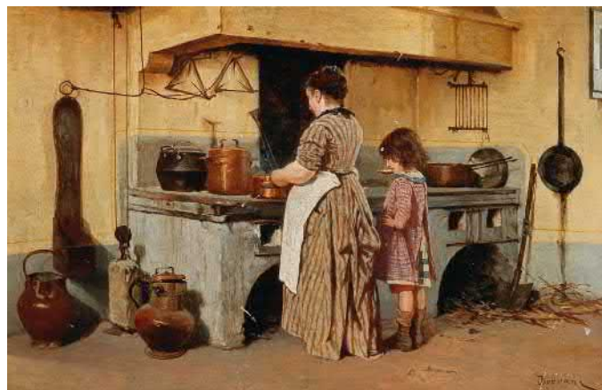
(Above: At the Stove by Italian Artist Odoardo Borrani)

Odoardo Borrani (1832-1905) was an important member of the Macchiaioli, a mid-nineteenth century artistic movement in Italy and cultural counterpart to the political and social campaign toward Italian reunification (Il Risorgimento) and the cessation of foreign rule. For the most part, the Macchiaioli were democratic intellectuals and artists in the late 1850s who opposed the authoritarian training at the Florentine Academy. They drew inspiration from their contemporary world, creating plein-air sketches of the Tuscan countryside and the humble existence of its inhabitants. Their paintings are characterized by a distinctive treatment of light and shadow and a democratic approach to composition and form.