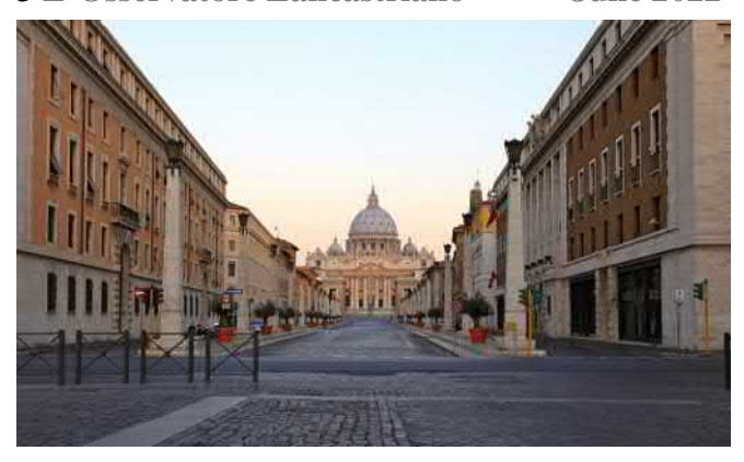
Article #3: The Famous Via della Conciliazione by Marian Caroselli

Via della Conciliazione (Road/Way of Conciliation) is a broad thoroughfare that leads to St. Peter's Basilica. It was built between 1936 and 1950. The road was begun by Mussolini to celebrate the accord reached in 1929 between his government and the papacy, which settled the so-called Roman Question. On February 11th, 1929, the world's smallest sovereign state came into being with the signing of the Lateran Treaty.