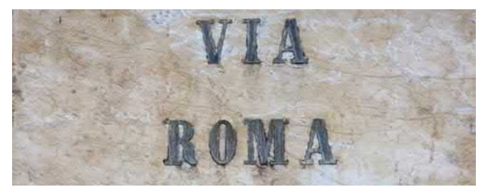
With much thanks to this link, from which I extracted the following information: <u>https://ouritalianjourney.com/revealing-10-top-street-names-found-in-italy/</u>

Article #2 Top Street Names in Italy (as of Nov. 2018) researched by Marian Caroselli