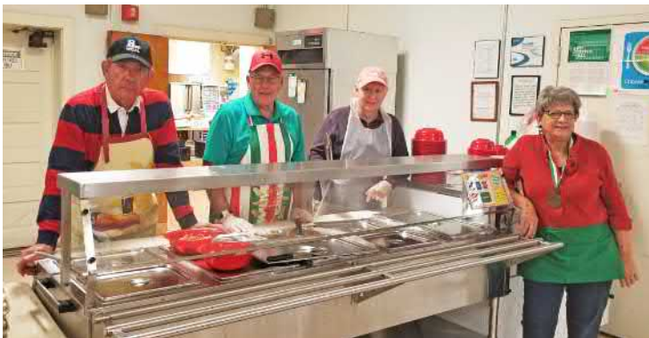
Bravi to the Kitchen Team at the Spaghetti Dinner!

Look for all the details regarding our activities in the Bollettino, the Newsletter, the Eblast, and on the LICS' Website.