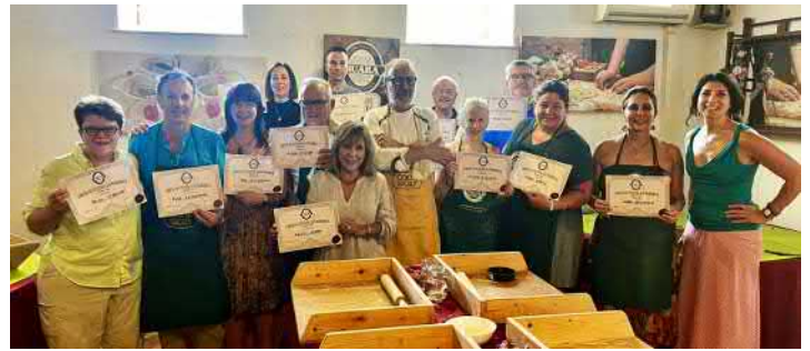
Above: Our Experience Sicily Cooking Tour group.