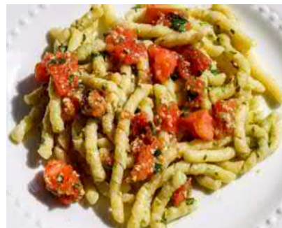
← Busiate (pasta) al pesto Trapanese