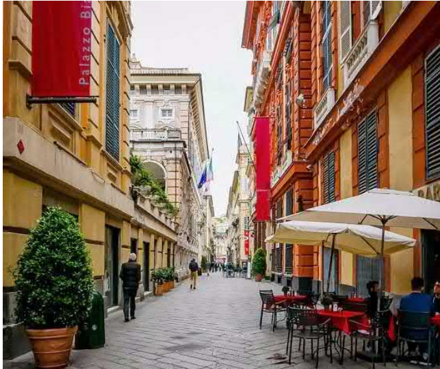
Above: Via Garibaldi, Genoa