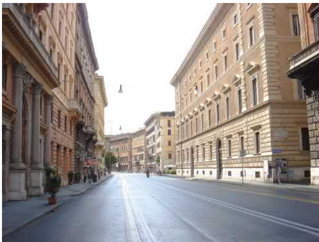
Above: Corso Vittorio Emanuele II, Rome

Thanks for joining the LICS family, and we hope to see you at the upcoming events.