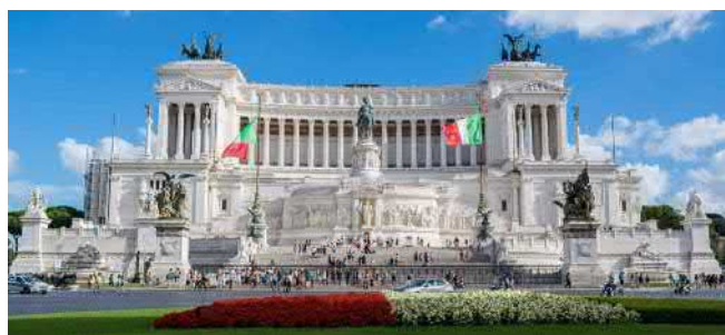
Above: Victor Emmanuel II Monument – Altar of The Fatherland in Rome

In Rome, Corso Vittorio Emanuele II, commonly known as Corso Vittorio, is a wide east-west thoroughfare that courses through Rome. It connects a bridge over the Tiber, Ponte Vittorio Emanuele II, to both the Via Torre Argentina and Via del Plebiscite. The latter Via continues east from Piazza del Gesù and along Palazzo Venezia to reach Piazza Venezia which sits below the massive white Monument to Vittorio Emanuele II.