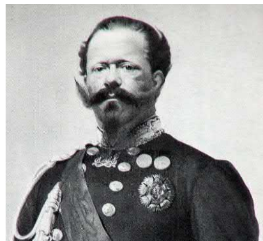
Vittorio Emanuele II - Father of the Fatherland

This time, their forces were victorious, and one city-state after another became united in the new country, until on 17 March, 1861, Vittorio Emanuele II of Sardinia became the “Padre della Patria,” or “Father of the Fatherland” – the first ruler of the Kingdom of Italy. He immediately declared Turin as the capital of the new country. It would remain so for five years, until it was moved briefly to Florence. There were still three city-states left to be liberated. Emanuele himself led troops during the third war of Italian Independence in 1866, which culminated with the annexation of Venice from Austria. In 1870, the reunification was complete when he sent the Italian Army into the Papal States to seize Rome, which subsequently would become the capital of all Italy.