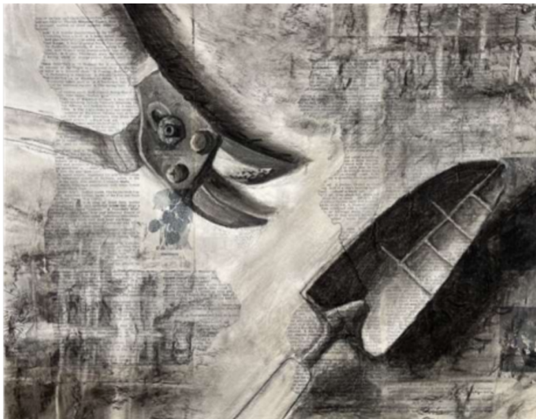
Garden Tools - Leonardo Da Vinci