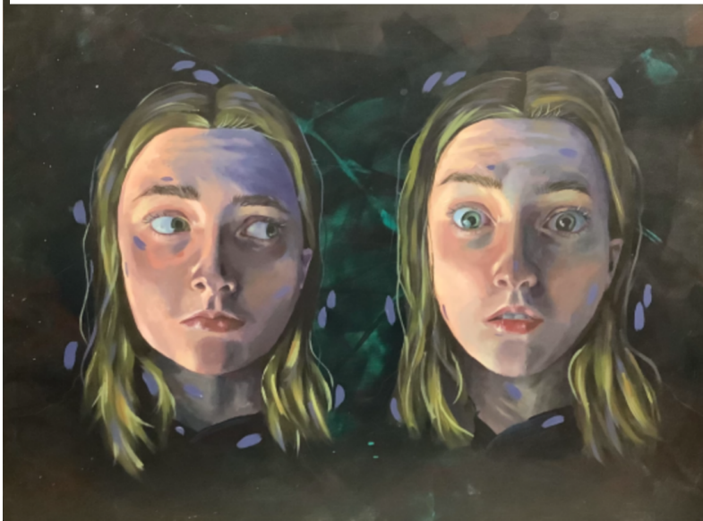
Uh - Oh? - Artemisia Gentileschi Award