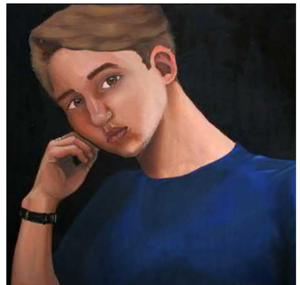
A Self Portrait - Michelangelo Award

Opening Reception on Friday, March 10 from 5 - 8 pm!