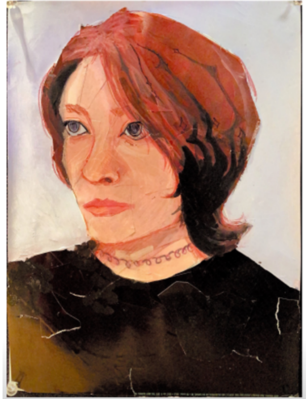
Self Portrait - Modigliani Award