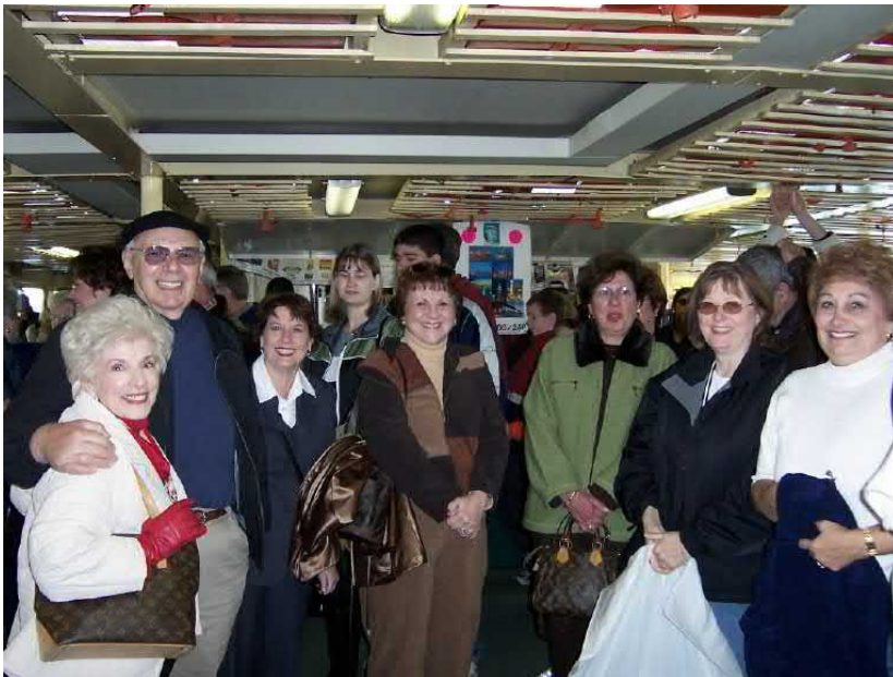
Members on the Ferry to Ellis Island