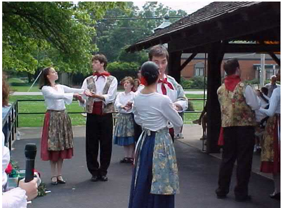
Lancaster Italian Dance Troupe at the Picnic