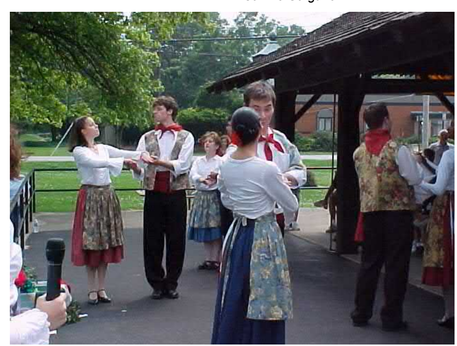
Lancaster Italian Dance Troupe at the Picnic