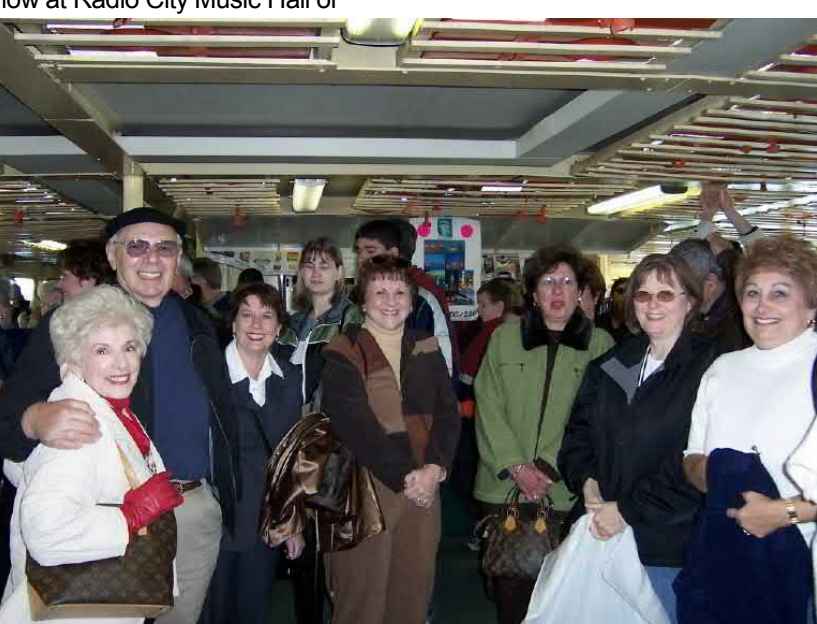
Members on the Ferry to Ellis Island

For more information about Ellis Island, visit: www.ellisisland.org